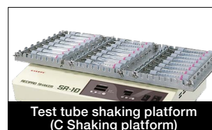
Test tube shaking platform (C Shaking platform)

2 sets of commercial test stand for 50 test tubes with \phi 18 mm stoppers can be fixed by laying them horizontally.