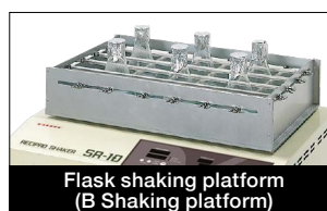
Flask shaking platform (B Shaking platform)

Capacity: 1 L × 6 pcs (Standard). The vessel size and capacity can be changed by adding the press bars.