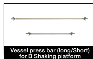
Vessel press bar (long/Short) for B Shaking platform

Capacity: 1 L × 6 pcs (Standard). The vessel size and capacity can be changed by adding the press bars.