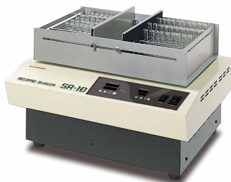
SR-1D with Test tube rack shaking platform (Optional)