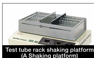
Test tube rack shaking platform (A Shaking platform)

Shaking platform is not included. Please purchase one of the following together.