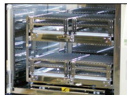
Installation of 4 pcs of LED units into the chamber of the Large sized Bioshaker