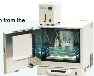
Basic system of CO 2 -BR-43FL for cultivation of Algae combined with CO 2 -BR.

Combination example ②: Irradiation from the top with a Medium sized BR LC-450EXP + Controller LC-LED-CON1 + Mounting bracket RSB-3424LED