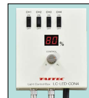
Optional controller LC-LED-CON4 that enables irradiation of up to 4 pcs with the same output