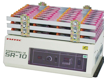
SR-10 with 2-tier platform