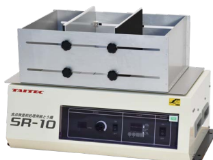
Example of Large test tube rack (Stoppered test tube inside)

We can provide Custom-made shaking platforms such as a large test tube rack (Stoppered test tube inside). Ask us for details.